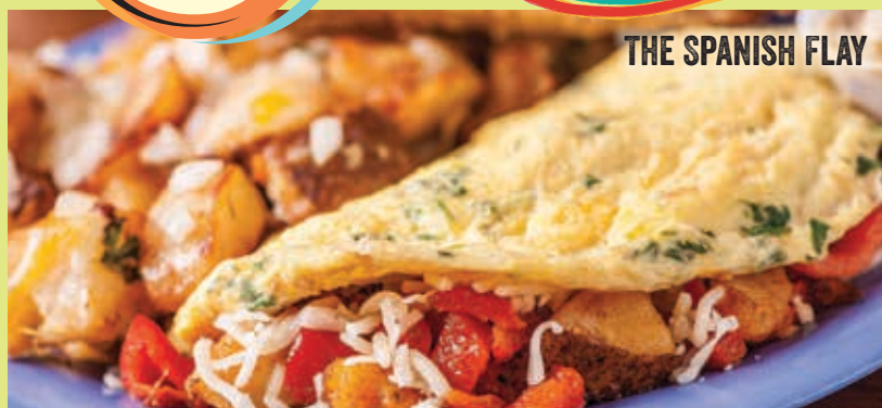
THE SPANISH FLAY