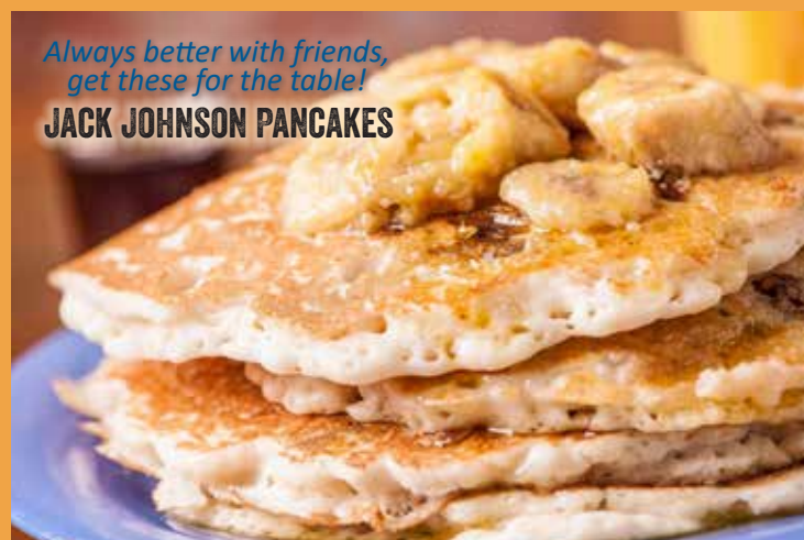
Always better with friends, get these for the table!