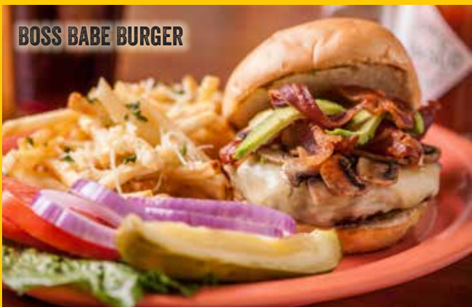
BOSS BABE BURGER

Cheers to every boss babe! A seasoned grilled hamburger topped with Swiss cheese, crispy bacon, sautéed mushrooms and avocado, served with romaine lettuce, fresh-cut tomatoes, sliced red onions and pickle chips. French fries, our special burger sauce and a pickle spear on the side – 16.49