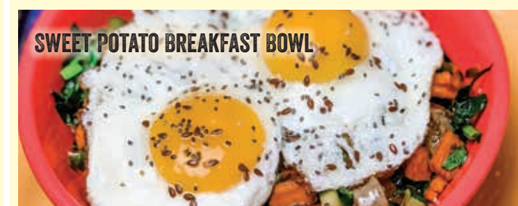
SWEET POTATO BREAKFAST BOWL