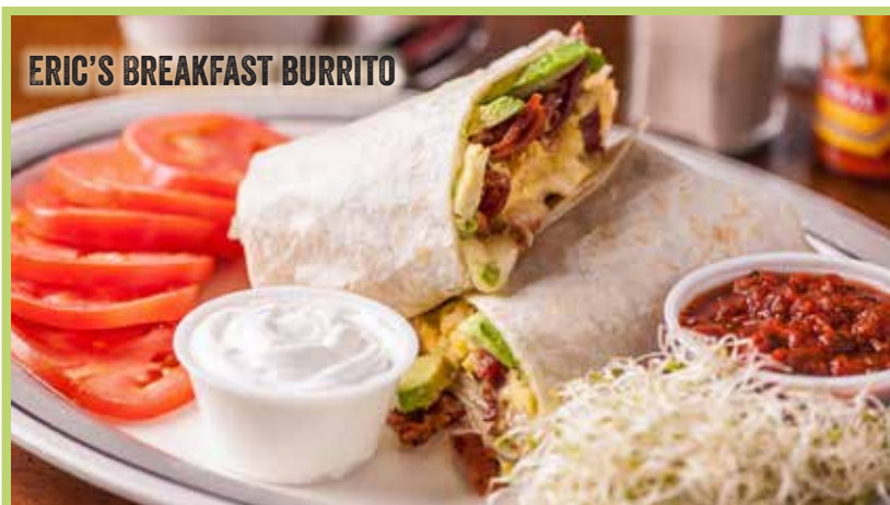
ERIC'S BREAKFAST BURRITO