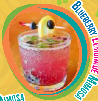
BLUEBERRY LEMONADE MIMOSA